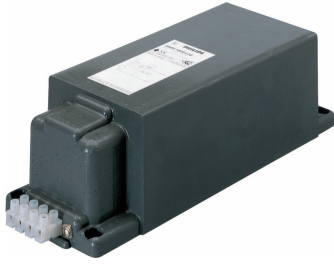
GPPR BHD-HP PHL