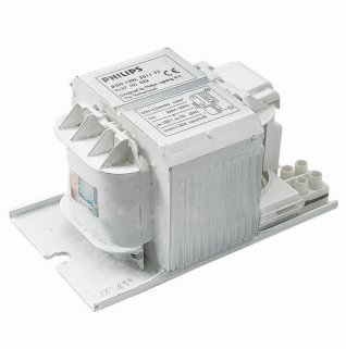
BHL 250L 200