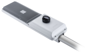
RoadFlair Gen2 BRP49X