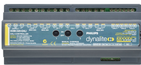
DDBC320-DALI 3 x 20A DALI Driver Controller front